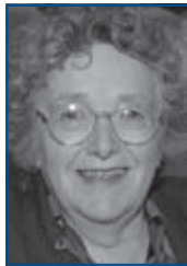
Dr. Rosemary Radford Ruether , professor at Claremont Graduate University in Claremont, California, gave a sweeping overview

WATER's teleconferences are a chance to hear and speak with leaders in the field of feminist issues in religion. This year we are featuring women who have chapters in New Feminist Christianity: Many Voices, Many Views . Many gather with colleagues over lunch to join the conversation. Afterwards, access them at www.hers.com/water .