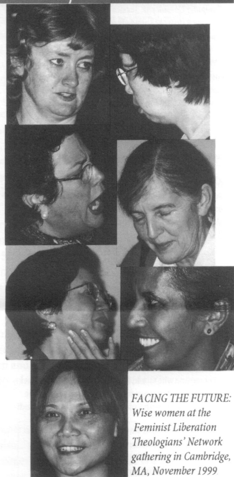
FACING THE FUTURE: Wise women at the Feminist Liberation Theologians' Network gathering in Cambridge, MA, November 1999

This globalized market coincides with the growing gap between rich and poor. In the (Continued on page 2)