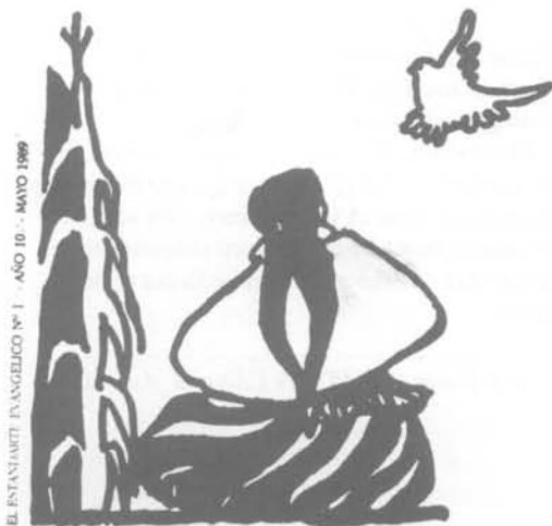
EL ESTANCIANTE EVANGELICO N° 1 - AÑO 10 - MAYO 1999

Let us eat the apple and honey remembering the joy in our lives.